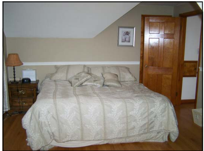
Upper master bedroom