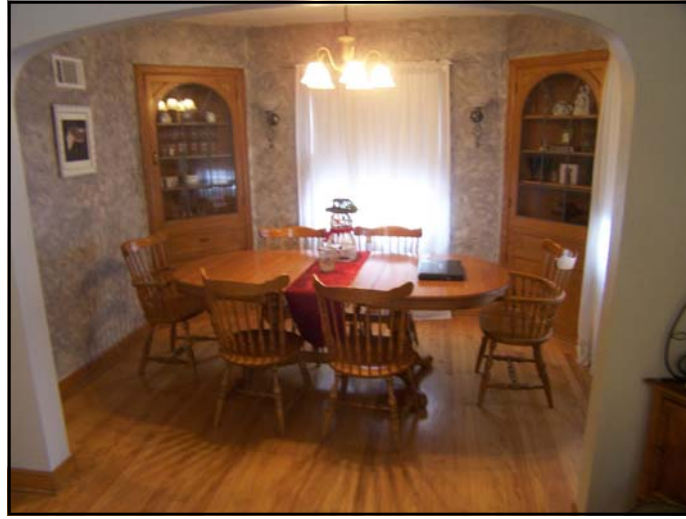
Dining room with 2 built in china hutches