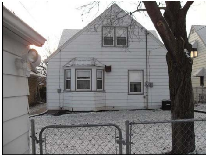
Back of house/fenced yard